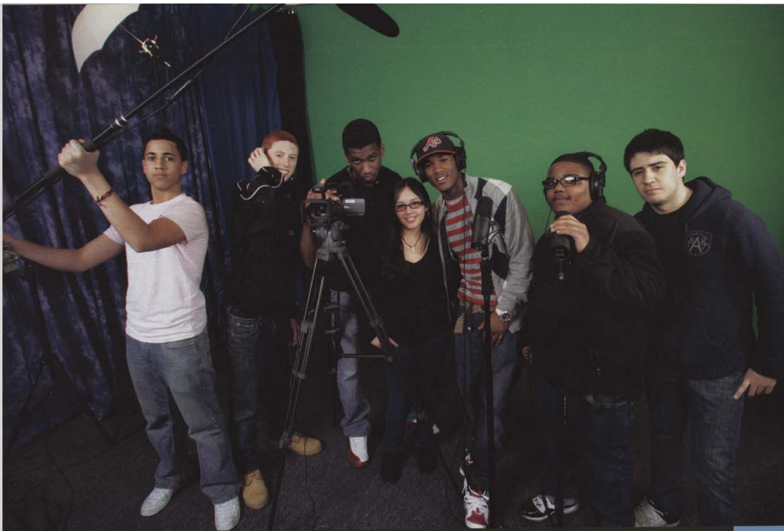
Sleepy Hollow's Media Lab produces television programming for cable TV.